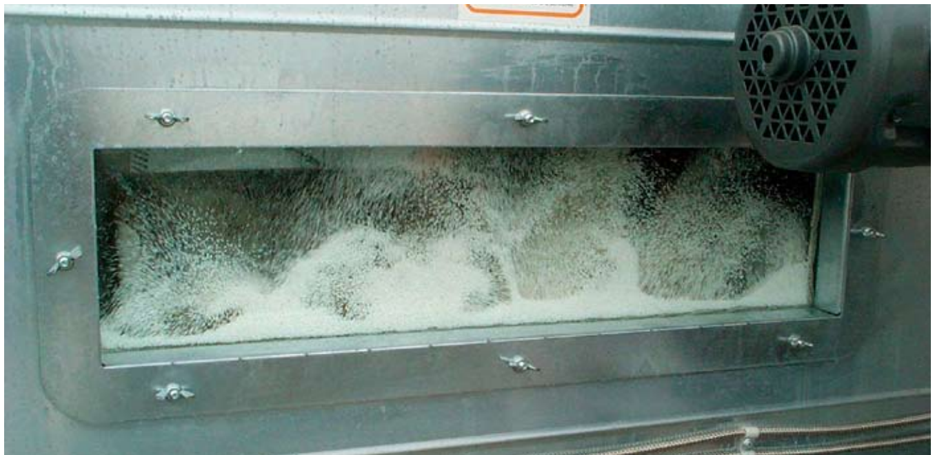
Product "Fluidized" in Conveyor