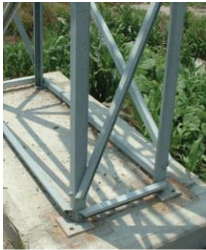
Easy bolt together galvanized steel components for ultimate strength and rigidity. High tensile strength, galvanized bolts and hardware make for a "total maintenance free unit".

Precision Fabricated Galvanized Steel for Fast and Easy Modular Erection Without Welding, Painting or Field Alteration