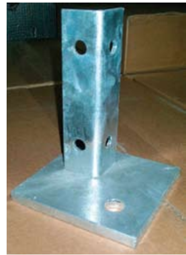
Heavy base plate provided with each tower. Bolts directly to tower legs and provides easy anchoring to plate or foundation.

Hot dipped, galvanized structural steel option available