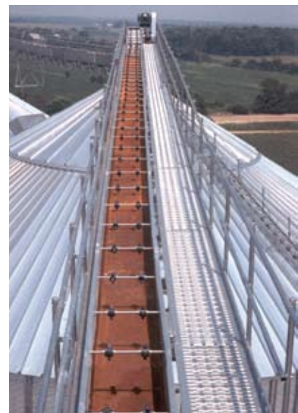
Covers removed for illustration purposes.