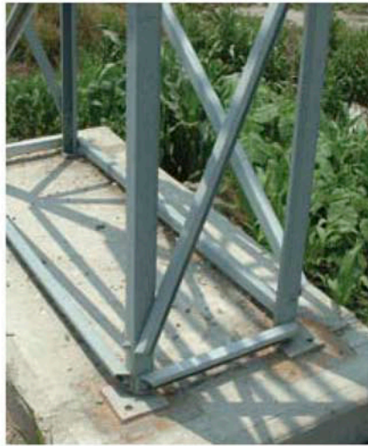
Easy bolt together galvanized steel components for ultimate strength and rigidity. High tensile strength, galvanized bolts and hardware make for a "total maintenance free unit".

Precision Fabricated Galvanized Steel for Fast and Easy Modular Erection Without Welding, Painting or Field Alteration