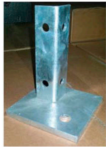
Heavy base plate provided with each tower. Bolts directly to tower legs and provides easy anchoring to plate or foundation.

Hot dipped, galvanized structural steel option available