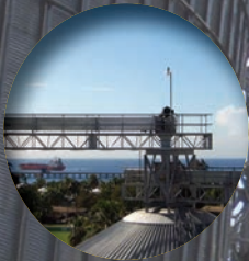
Drag & Belt Conveyors