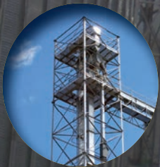
Support Towers & Catwalks