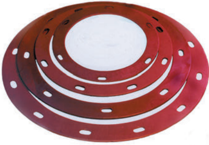
Plate Rings (Loose – 10 Ga.)